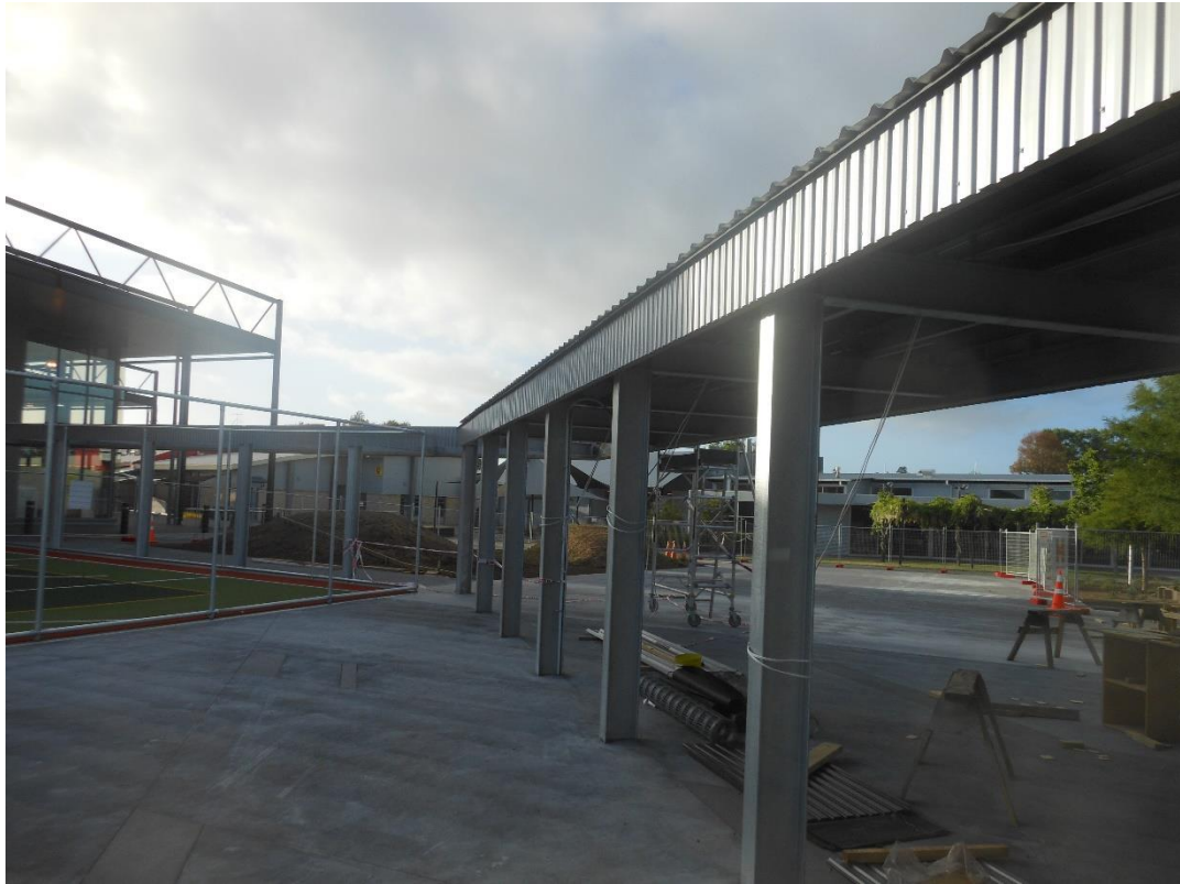
The eastern canopy with the cladding and roofing being installed.