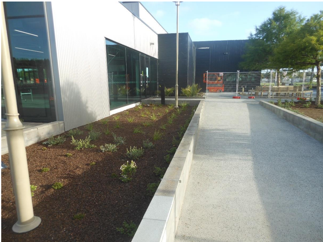
The new ramp concrete and planting completed