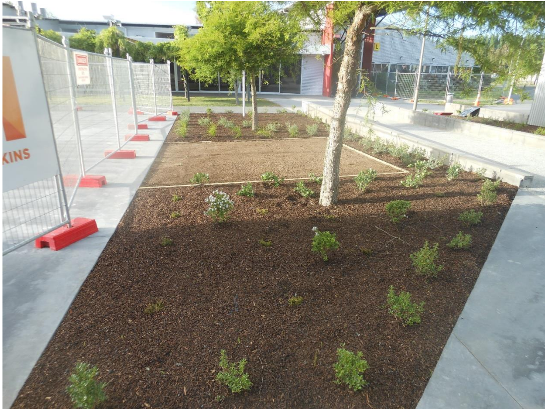
Some of the planting completed on the eastern side.