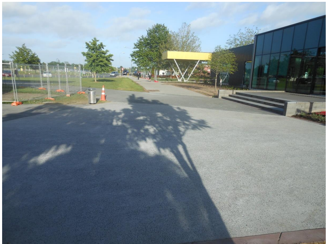
The student street completed