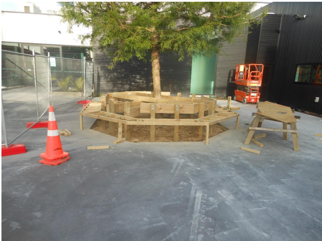
The tree seat furniture progressing.