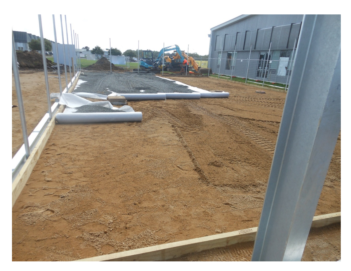
The sport court construction is well underway.