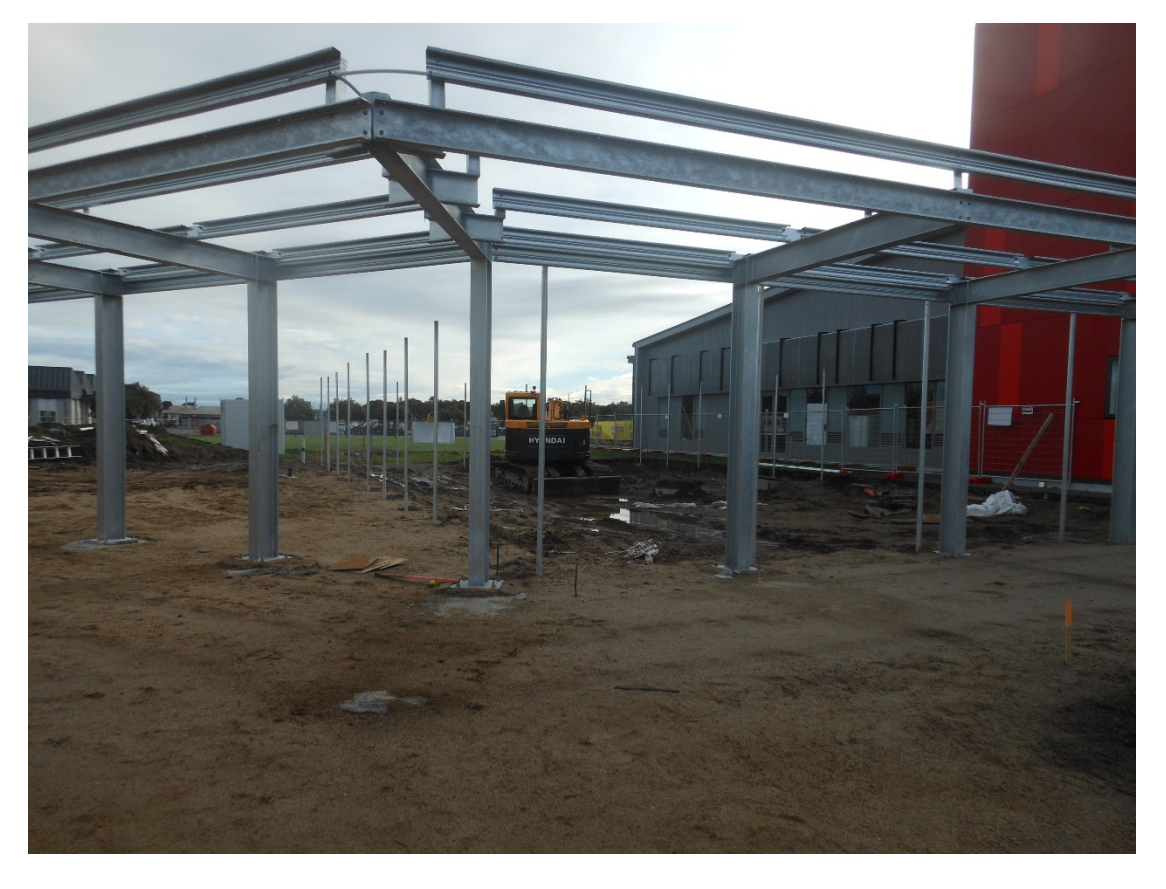
The fence posts installed for the sports court.