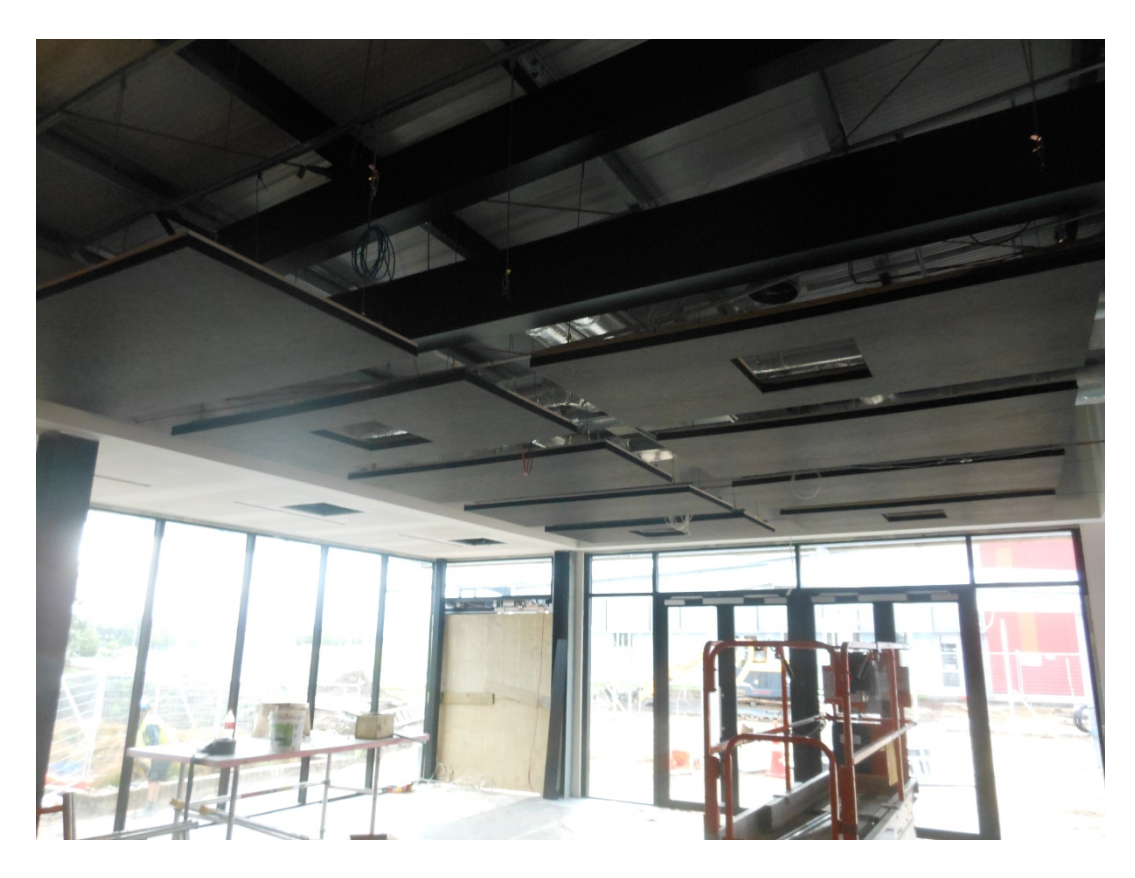
The acoustic ceiling panels being installed inside the new café.