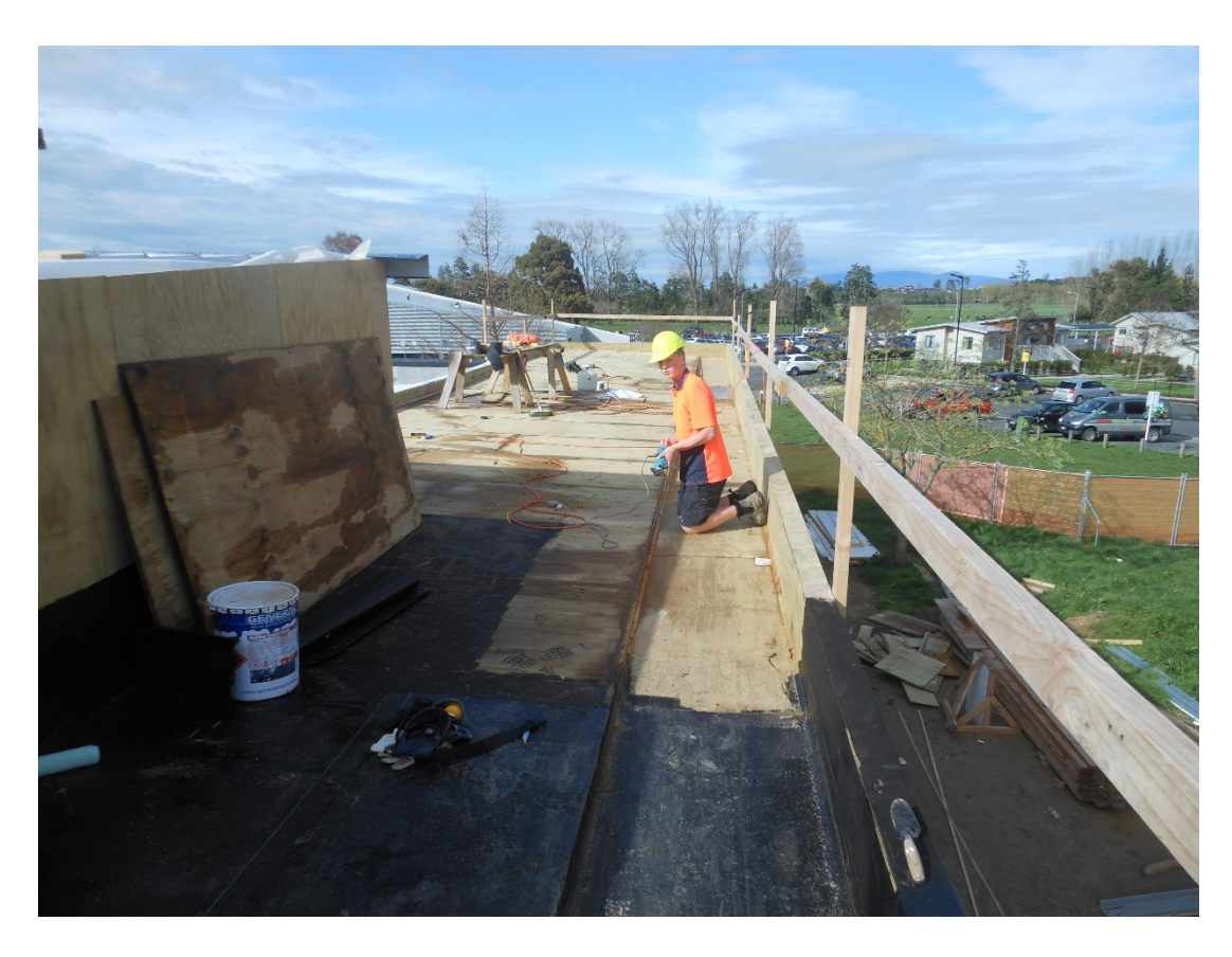
The plywood completed on the western walkway