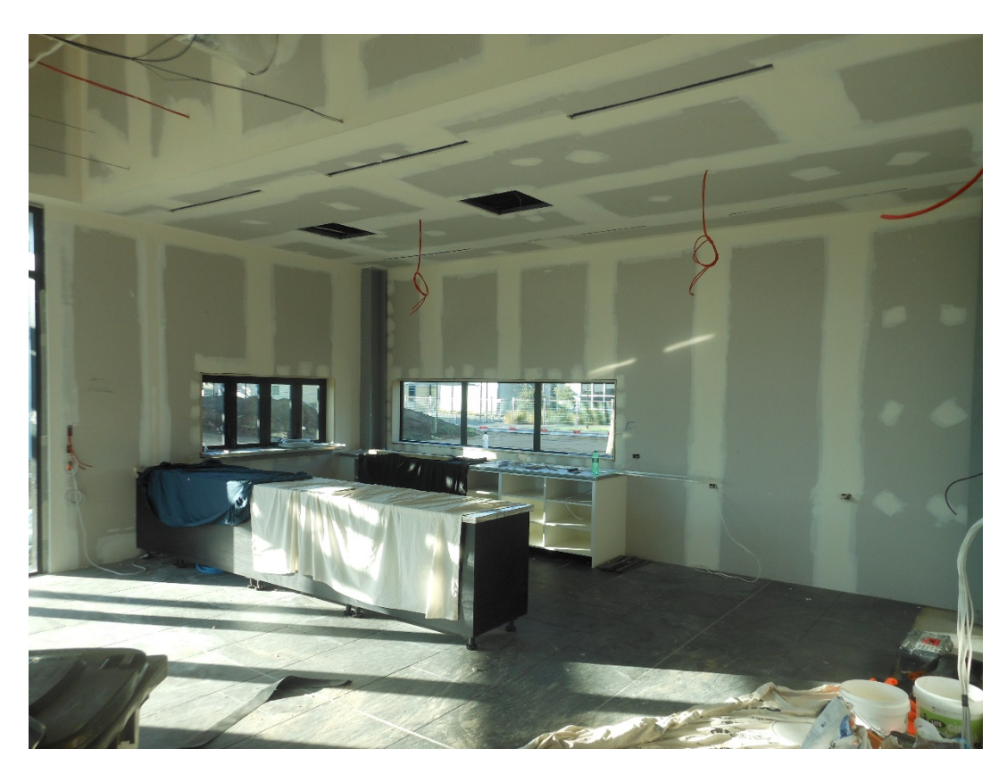
The new café are with the joinery installed.