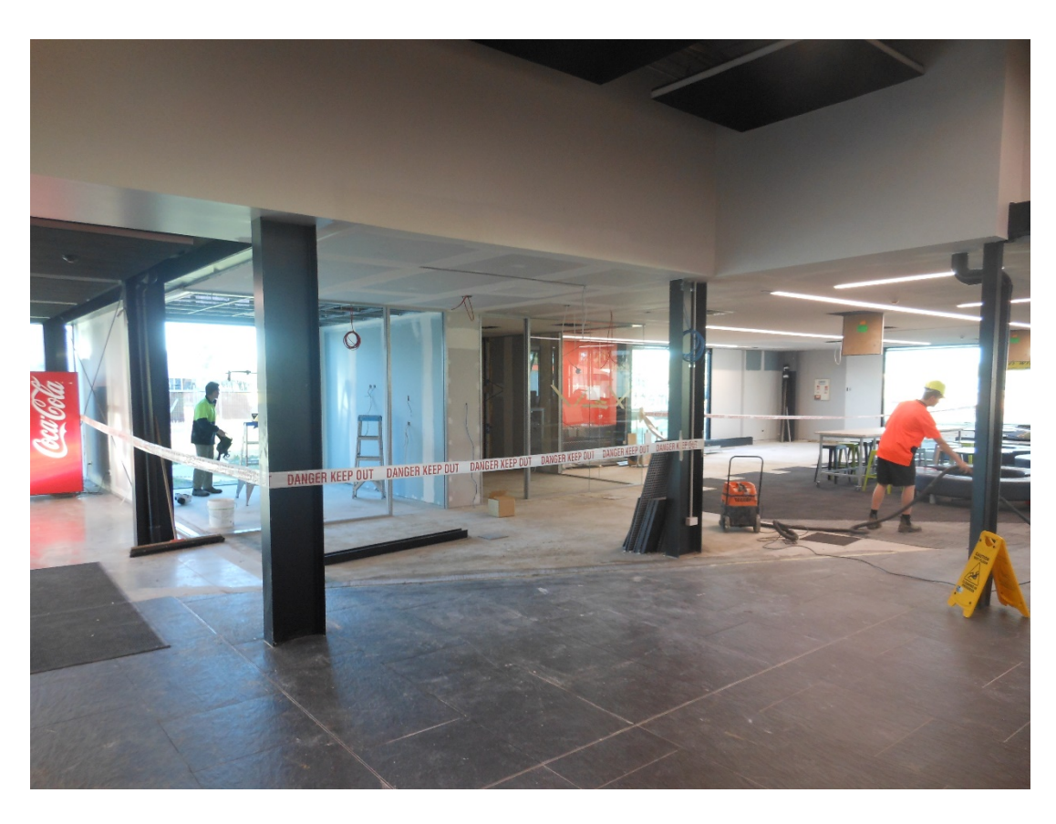
The southern area has been opened up so the floor coverings can be completed