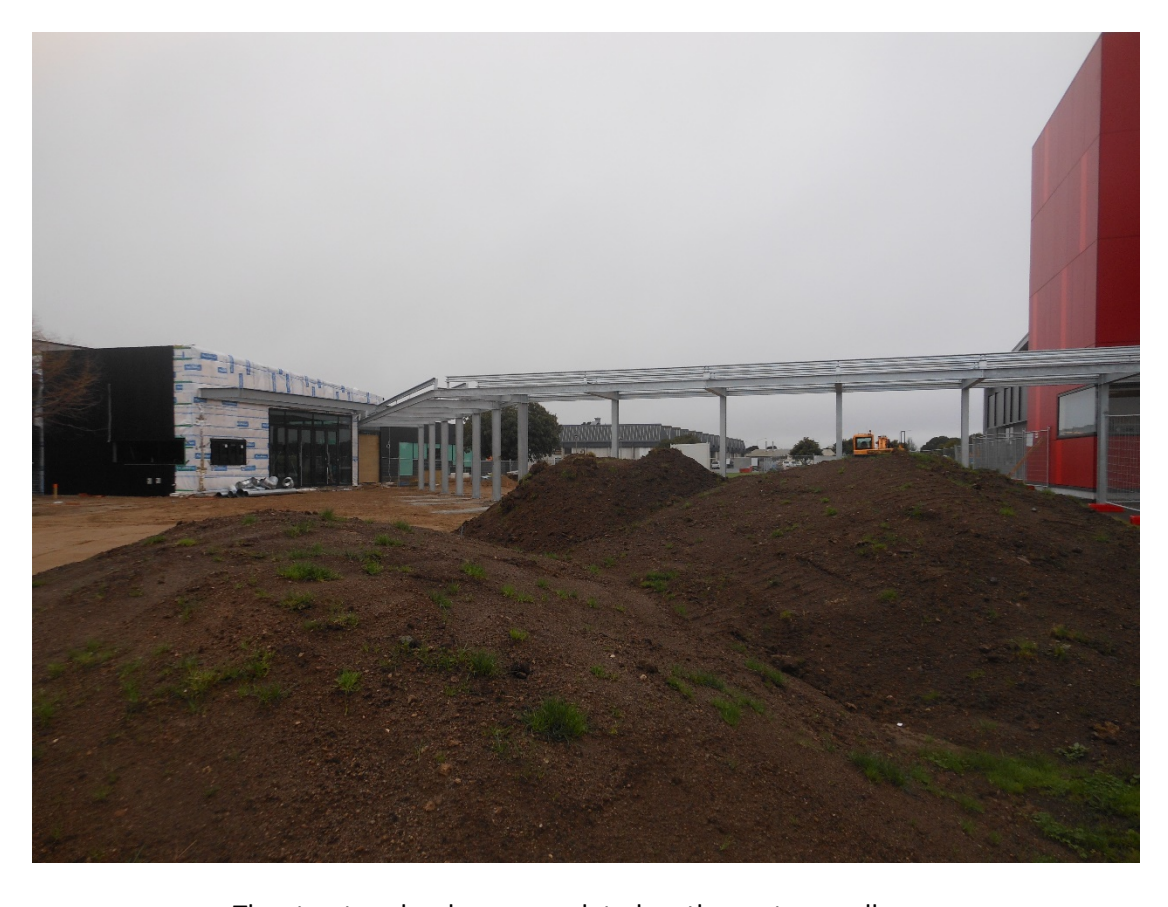
The structure has been completed on the eastern walkway.