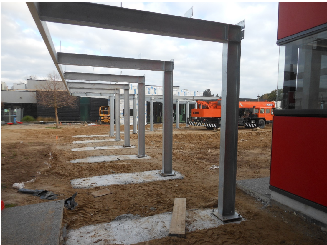
The Structural steel has been erected on the eastern side.