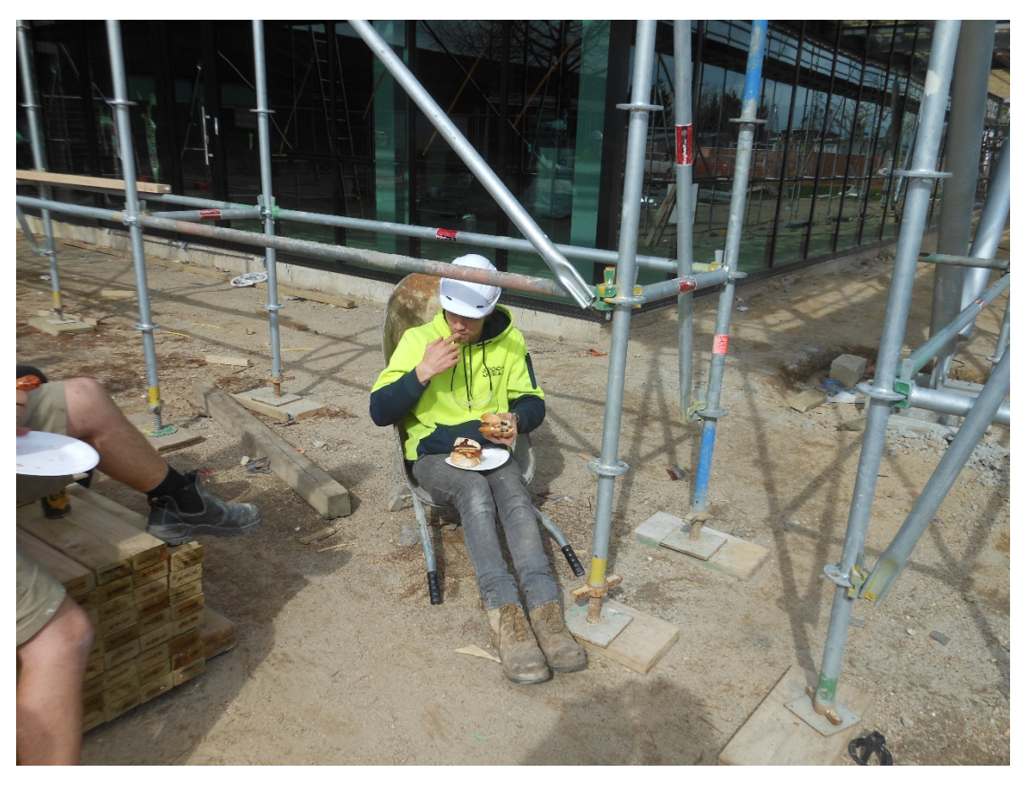
There was a BBQ on site on Friday and some of the team "over indulged" \ensuremath{\mathfrak{S}}