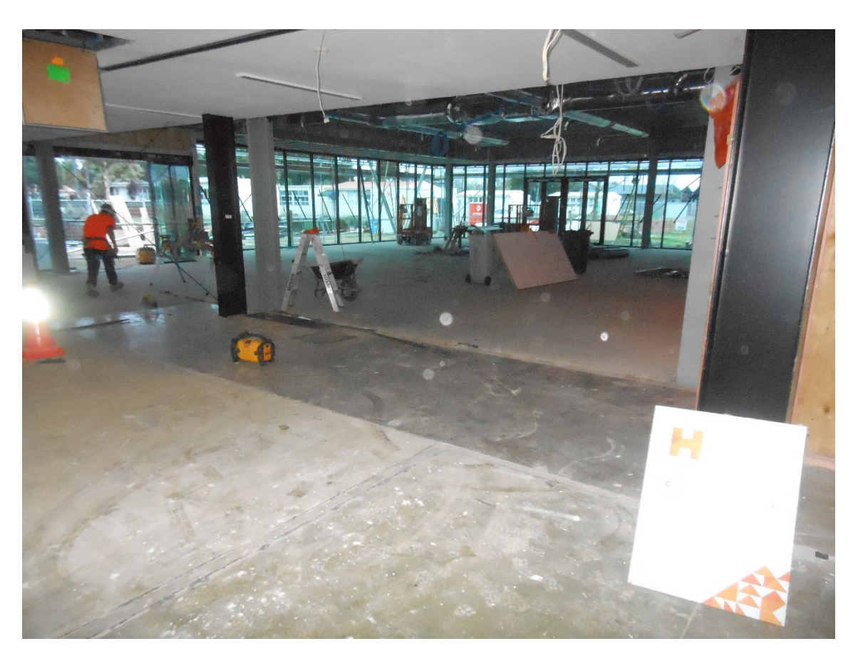
The exterior walls have been removed from the western extension