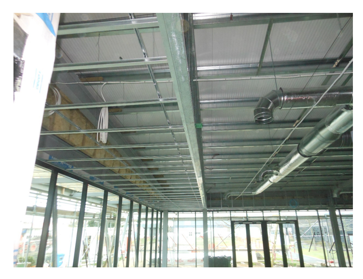
The framing for the bulkhead in the western extension