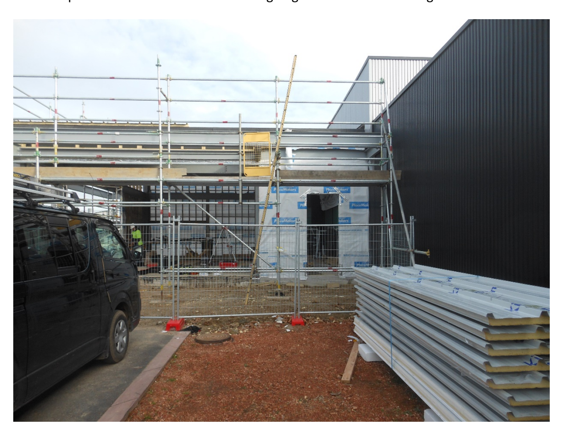
The wall framing on the eastern side completed and wrapped ready for the windows.