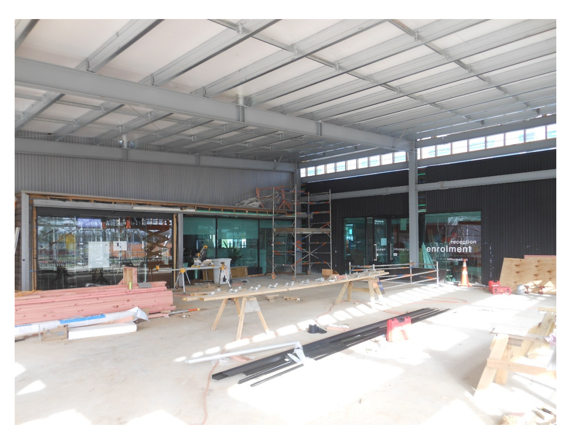
The space on the western side is looking huge now that it is starting to be closed in!