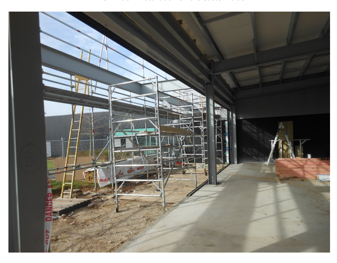
The window installation on the western side underway.