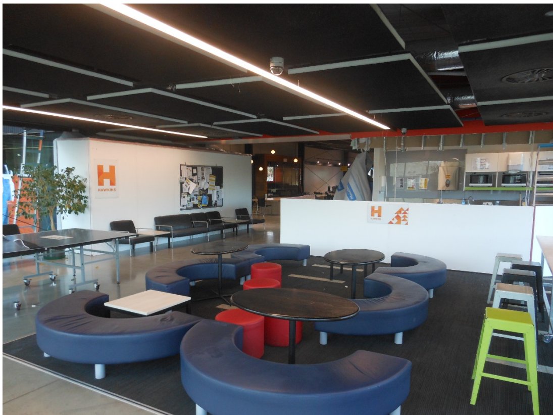
The inside works where hoarded off and demolition got underway last week