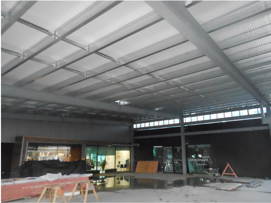
The roof certainly makes the space feel bigger!