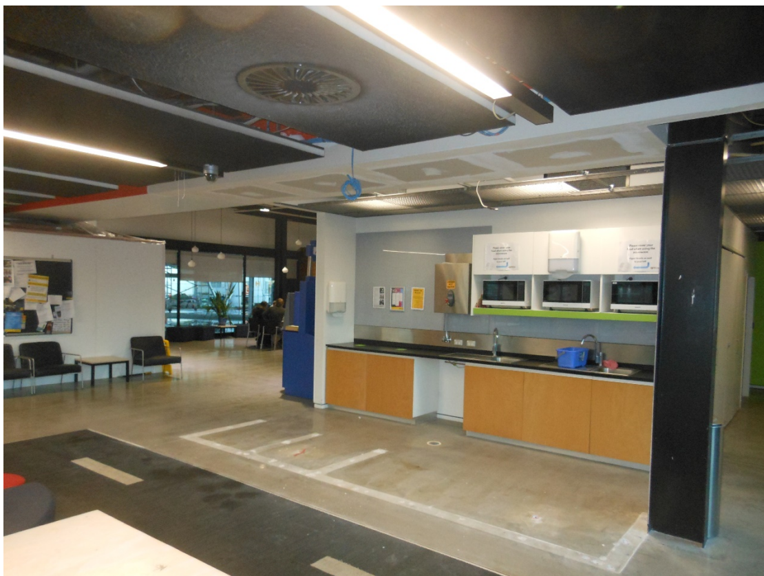
The demolition completed and the new bulkhead is constructed.