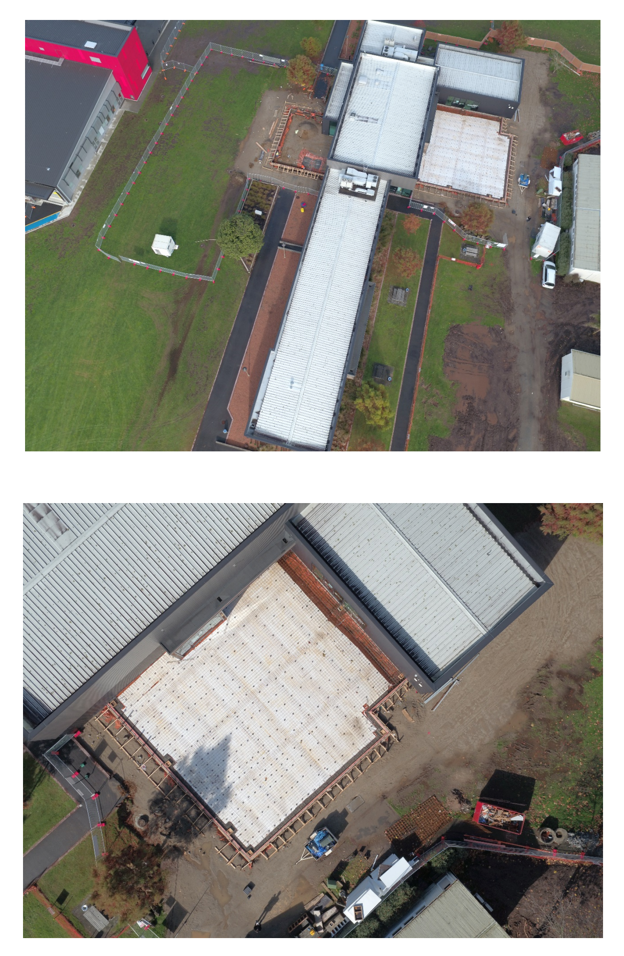
There were some more great shots taken by the drone last week