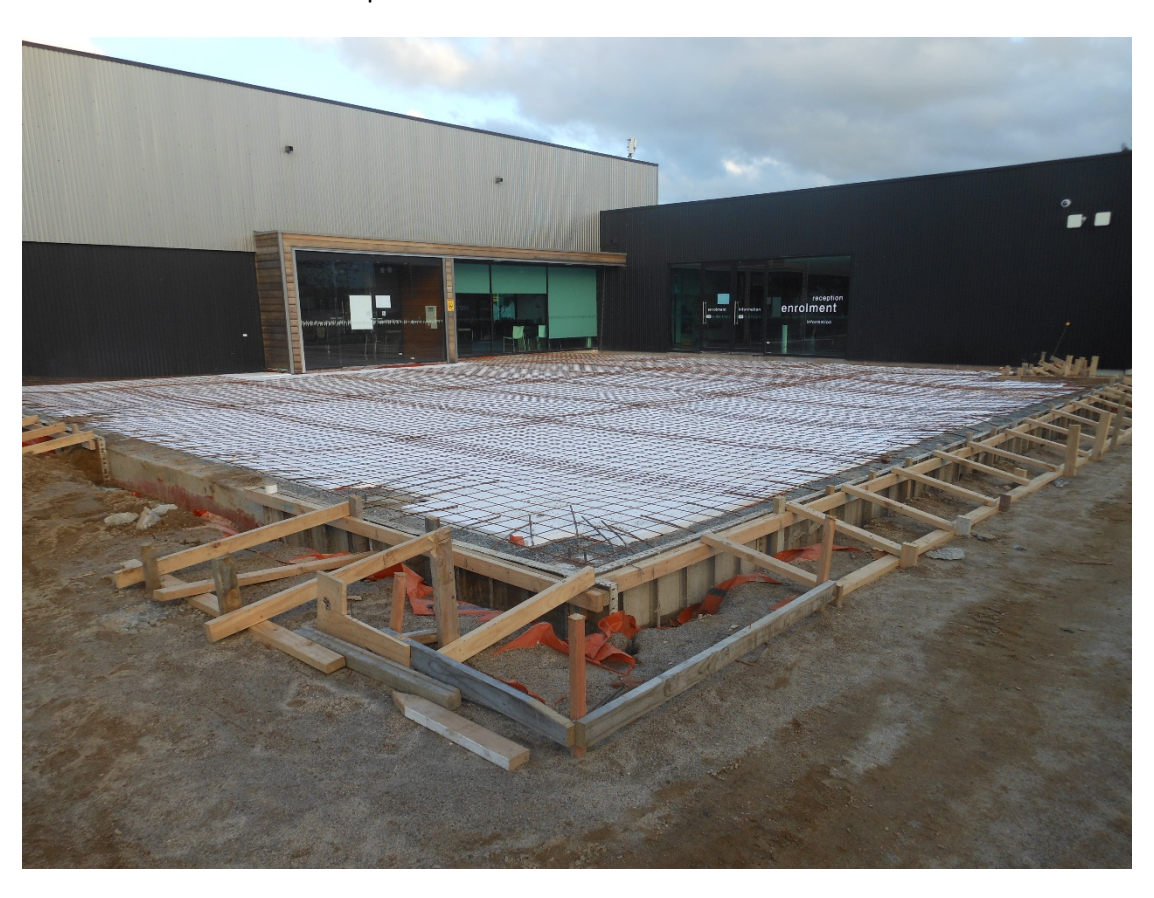
The floor slab is almost ready for the concrete to be poured