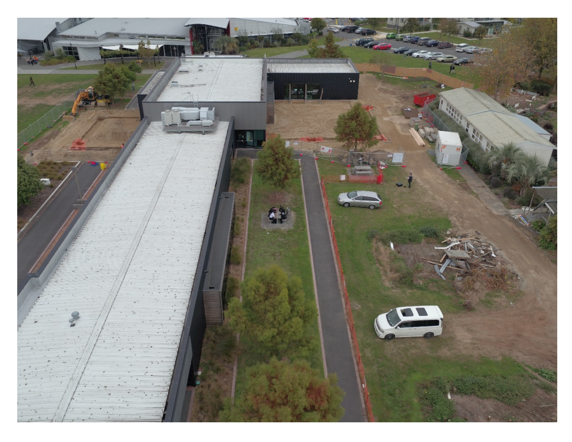
The site looked a lot dryer two weeks ago!