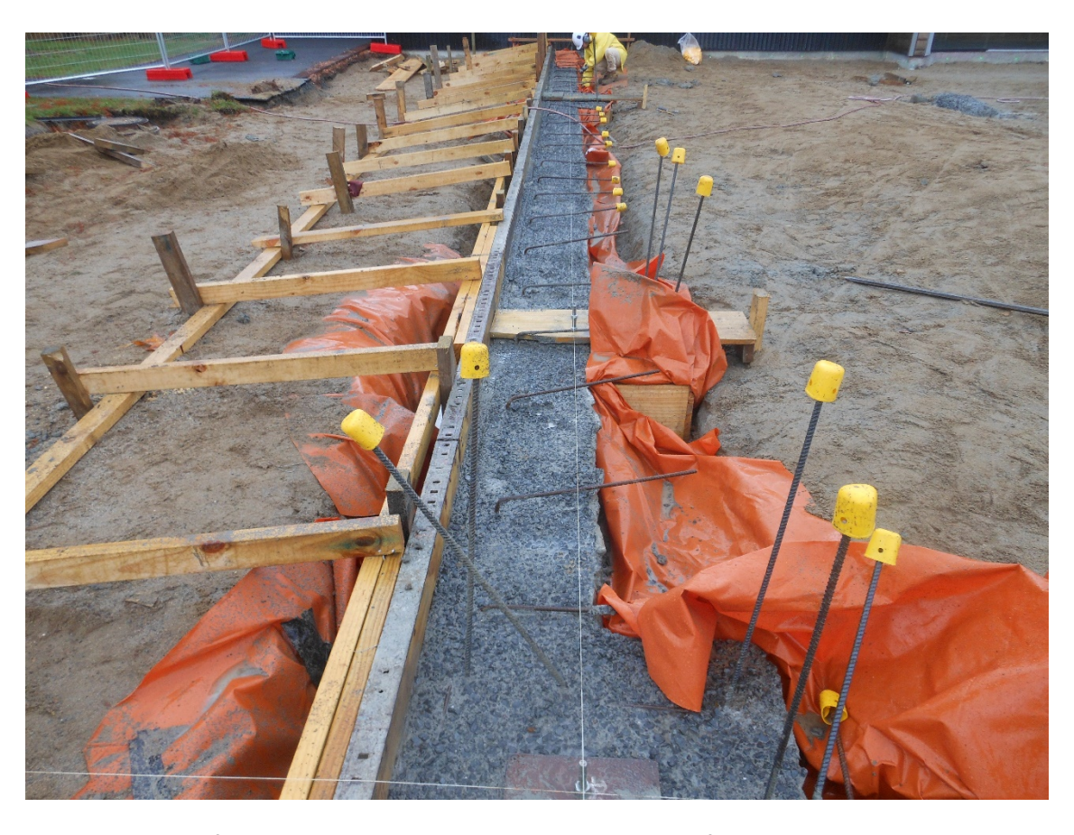
The foundations poured and water blasted so the floor will bind to it.